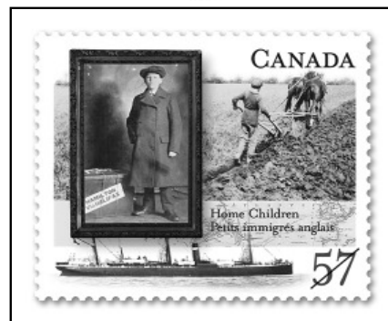
See the story of this Canadian stamp on page 138. © Canada Post Corporation (2010) Reproduced with permission.