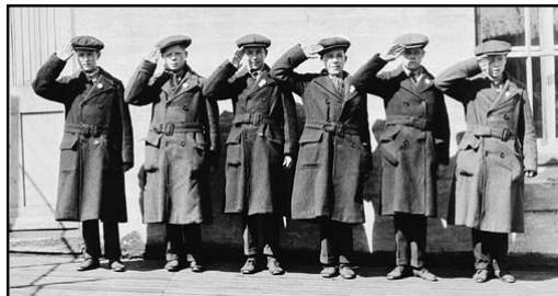
Canada has designated 2010 the Year of the British Home Child. See the story on page 5. Photo of a group of Barnardo Boys, April 1922